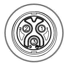
Pin Assignments Front View