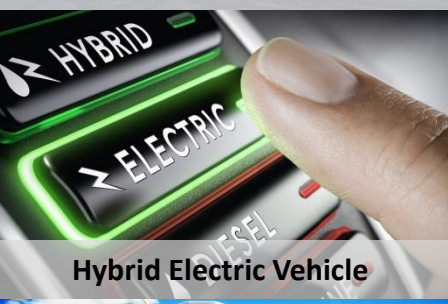
Hybrid Electric Vehicle