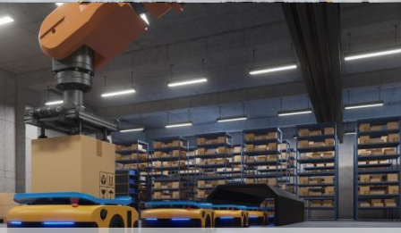
Lift & Material Handling